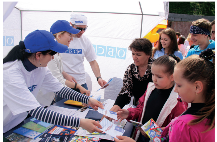
OSCE-supported campaigns help inform Ukrainians of the risks of human trafficking as well as how to deal with domestic violence.