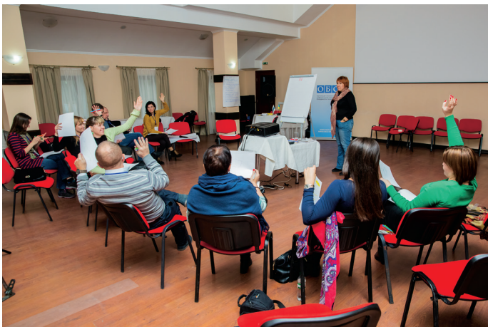
Ukrainian dialogue facilitators acquire international expertise and exchange information about local best practices at an OSCE-organized training course.

The Project Co-ordinator replaced the OSCE Mission to Ukraine, which functioned between 1994 and 1999.