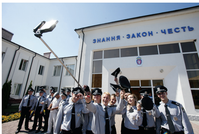
The first group of cyberpolice officers celebrate graduation from a training course developed by the OSCE Project Co-ordinator.