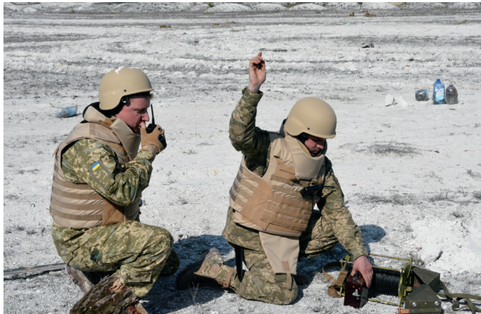
Ukraine's deminers use protective equipment provided by the OSCE Project Co-ordinator to clear conflict-affected areas of explosive remnants of war.

Co-ordinator assesses the scope of environmental threats caused by military activities in the east of the country to develop environmental rehabilitation strategies, builds the humanitarian demining potential of the national authorities and assists in developing legislation to regulate mine action, establish standards, and introduce licensing for demining personnel. The Co-ordinator also focuses on improving the regulatory framework for chemical safety and security and emergency responses.